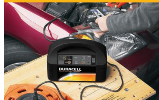
15 Amp Battery Charger