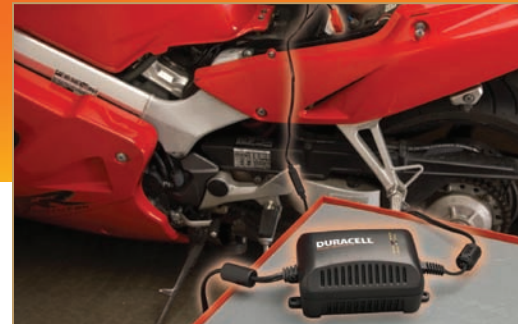
2 Amp Battery Maintainer