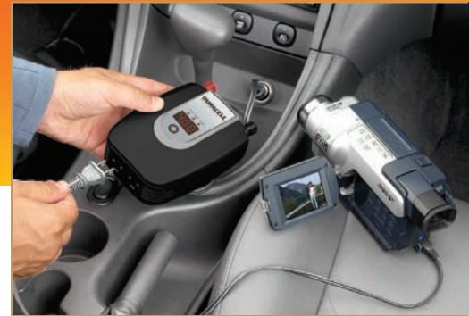
Portable power in your vehicle