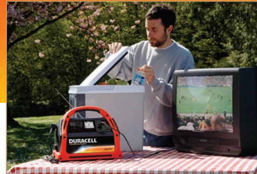
Portable power anywhere